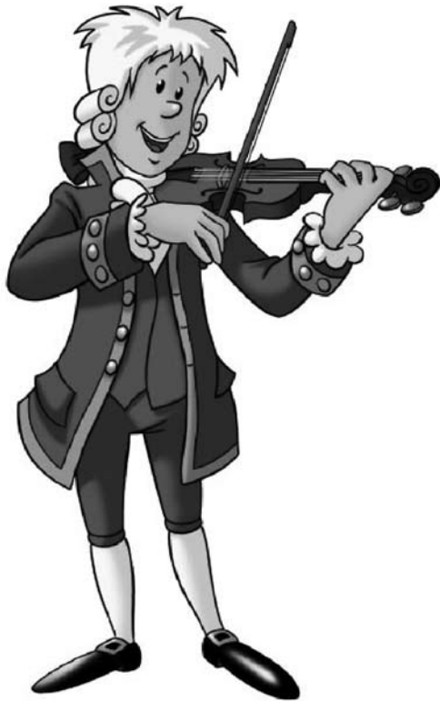
Little Wolfgang Amadeus Mozart playing the violin.