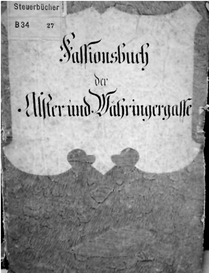
A-Wsa, Steueramt, Fassion B34/27

mit den hierüber erfolgten ämtlichen Berichtigungen / Nach dem Patentsformular Nro. II'. But this does not mean that these records really cover exactly this period of time. Actually they represent the rental status of the following year and some of the entries even refer to the year 1790. Therefore Mozart is not registered in the Steuerfassion under Landstraße 224, but in the volume that contains his address for the following year, i.e. the tax register of the 'Gemeinde Alster= und Währingergasse' (Alsergrund).[12]